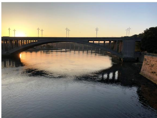
Sunset by the bridges at Berwick-upon-Tweed

The preface to The Methodist Hymnbook 1933 starts "Methodism was born in song". Charles Wesley started writing hymns in 1738. After various collections had been published, John Wesley's definitive "Large Hymnbook" was published in 1780.